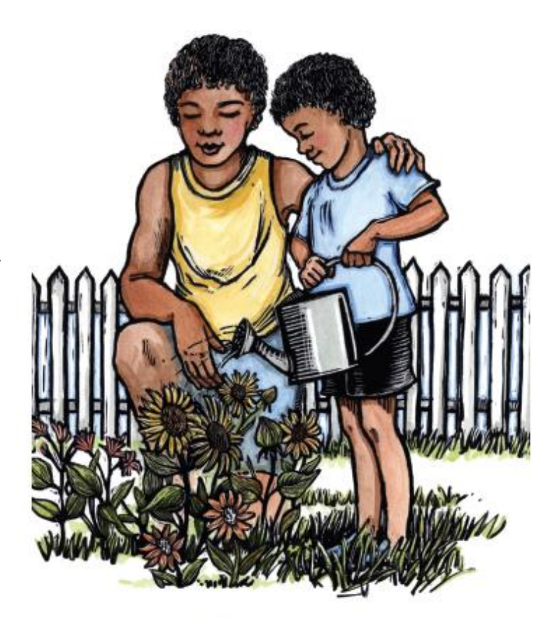
Conversing with family about how God is acting in our lives can help us more readily see God within our daily routines.

These moments when we feel God breaking through the ordinary become more apparent when we take time to notice them. You might write down one thing for which you are grateful each day. You might take five minutes to review the day's events to see where God's presence was most apparent. Over a meal with the ones you love, already a place of sacred encounter, you might converse about how God is acting in each of your lives in ways big and small. Making this a part of your regular family routine can yield big results in terms of seeing God's action bursting through the ordinary because, in large part, we only notice what we are looking for.