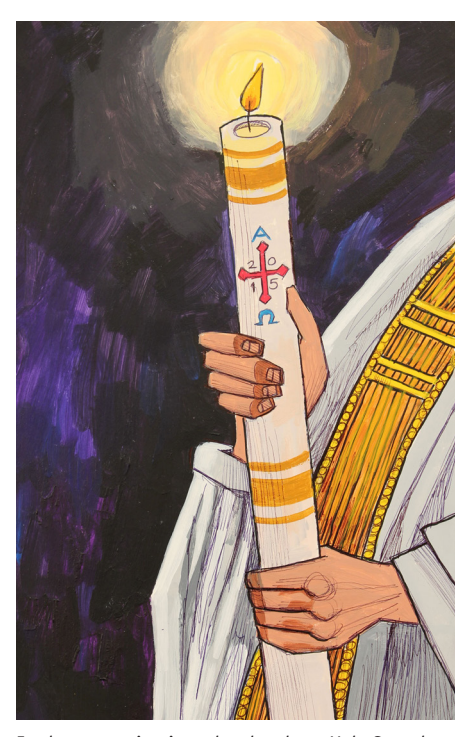
In the procession into the church on Holy Saturday, the faithful follow Christ our light into new life.

At the end of the liturgy during the Evening Mass of the Lord's Supper, the faithful will follow the priest in procession as he brings the Blessed Sacrament from the altar to a place of repose. This is not an ordinary procession. It begins after the priest has incensed the Eucharist, continues with the faithful singing "Pange, Lingua" or another Eucharistic hymn, and ends with silent adoration. This procession symbolizes the community's journey with Jesus as he moves closer to his passion and death.